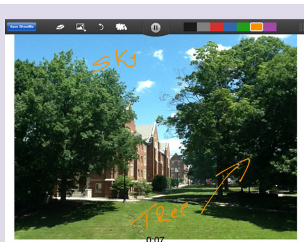
Figure 3. Users can type and draw on graphics with the ShowMe and Educreations apps.